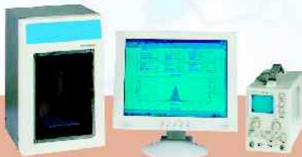
LPC 10 A