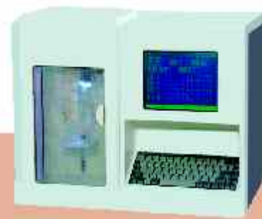
LPC 10 B